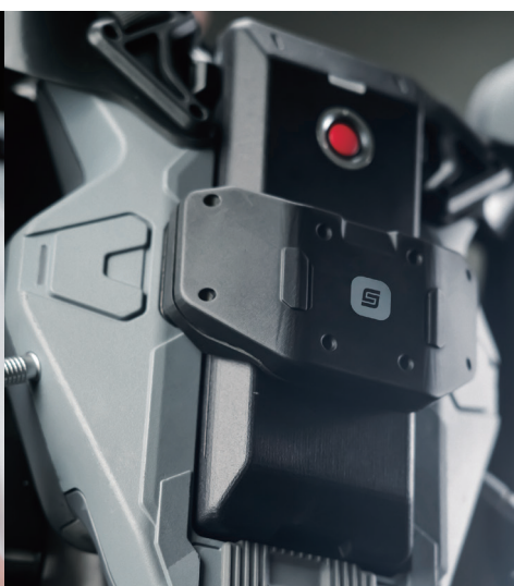
Quick-detachable Lithium Battery