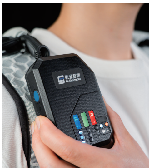
Independent Bilateral Arm Assistance

The FIT-U upper limb exoskeleton robot consists of an upper limb control system, a shoulder control system, and an integrated control system, providing intelligent electrical assistance for the user's shoulders, arms, and waist. The product features a self-developed motion control card and matching drive units. It provides strong support for enterprises in heavy physical labor positions by reducing the labor burden of workers by more than 50%, reducing worker turnover, and improving production efficiency. The exoskeleton's gradually established data collection and learning capabilities will provide valuable suggestions for enterprise management personnel on employee efficiency and health data analysis in the future.