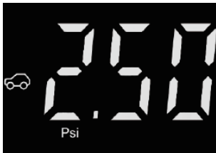
Tire 2.50 bar

(5) The default inflating mode is auto tire mode, the unit is Bar, and the parameter is 2.50. Press R to switch to other modes