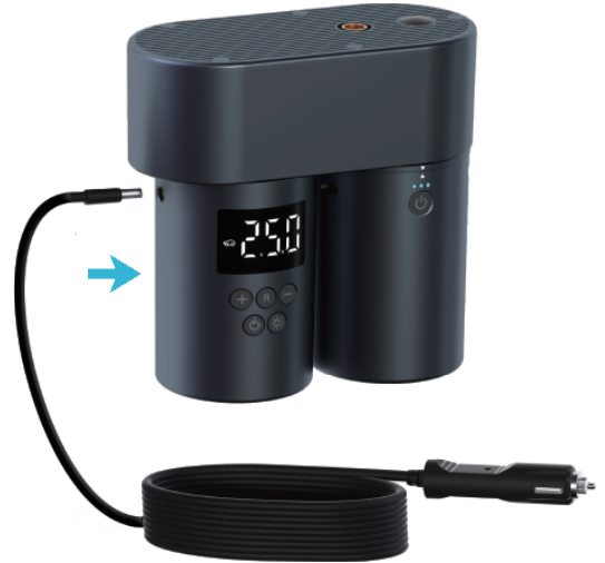
Cigarette lighter wire

(2) Insert the plug into the onboard cigarette lighter interface, and then plug the other end of the DC connector into the DC socket interface on the left side of the air pump body to power on.