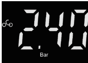
Motorcycle 2.40 bar