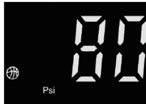
Basketball 8 psi

(6) There is a temperature protection switch inside the air pump. When the internal temperature of the air pump is too high, it will automatically stop inflation, and the screen will display hot (as shown on the right). When the screen returns to the normal tire pressure value, you can press the start button again. Start running.