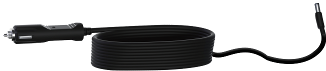
Cigarette lighter wire

5. If there is no Power Bank or Power Bank is short of electricity, you can use the vehicle-mounted cigarette lighter data cable attached to the product for power supply