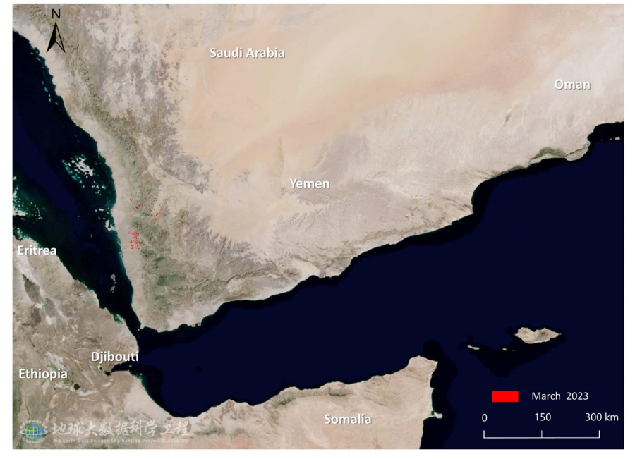
Fig. 1 Monitoring of Desert Locust damage in Yemen (March 2023)

thousand hectares of shrub (Figure 1), accounting for 2.2% and 1.0% of the total area of grassland and shrub, respectively. Compared with February 2023, the newly damaged vegetation area was 30.3 thousand hectares, including 3.5 thousand hectares of grassland, and 26.8 thousand hectares of shrub. Compared with the same period last year, the damage to vegetation caused by desert locusts shows a trend of decreasing. Al-Hudaydah province had the largest area of vegetation affected, with 23.3 thousand hectares. Followed by Amrān province, with 9.4 thousand hectares of vegetation affected. And then Hajjah province, with 8.0 thousand hectares of vegetation affected. The affected areas of vegetation in Al-Mahwīt, San'ā and Raymah provinces were 2.1, 0.7 and 0.2 thousand hectares, respectively.