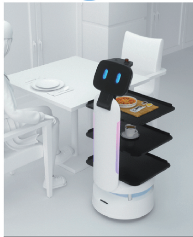
Intelligent Food Delivery