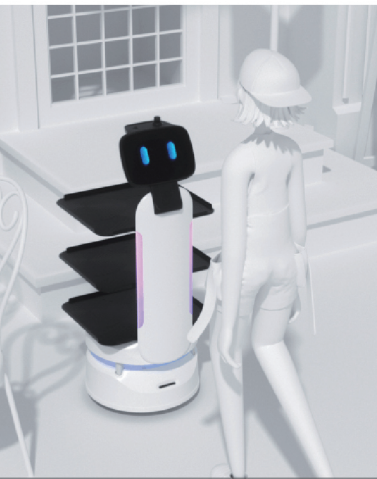
Attract and greet customers