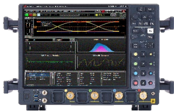
1 mm input model

Choose your Infiniium UXR real-time oscilloscope model. There are 3 main models based on input connector size: 1mm, 1.85 mm, and 3.5 mm. Infiniium UXR-Series models offer bandwidths from 5 GHz to 110 GHz with various 1-channel, 2-channel, or 4-channel configurations available.