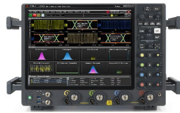
3.5 mm input model