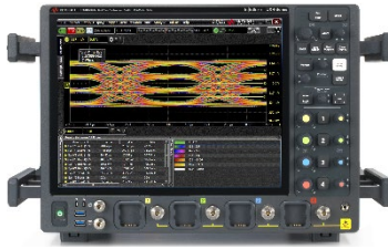
1.85 mm input model