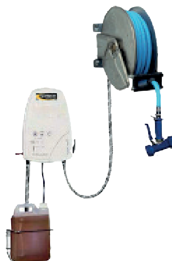
Ref. 15 m: CNET11/1F Ref. for Dual product: CNET11/2F