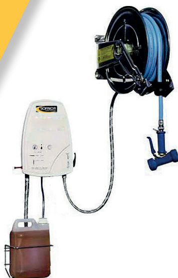
Ref. 20 m: CNET11/1120 Ref. for Dual product: CNET11/2120