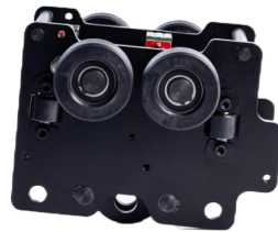
DOUBLE DRIVE TROLLEY S