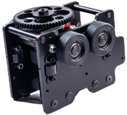
DOUBLE DRIVE TROLLEY M