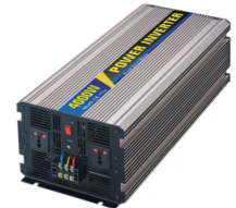
CTSW4000 Else Shapes are same .size not same