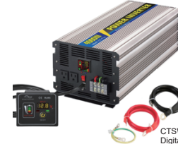
CTSW4000— E Digital display and remote control option