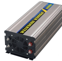
CTSW4000 DC Side Else Shapes are same .size not same